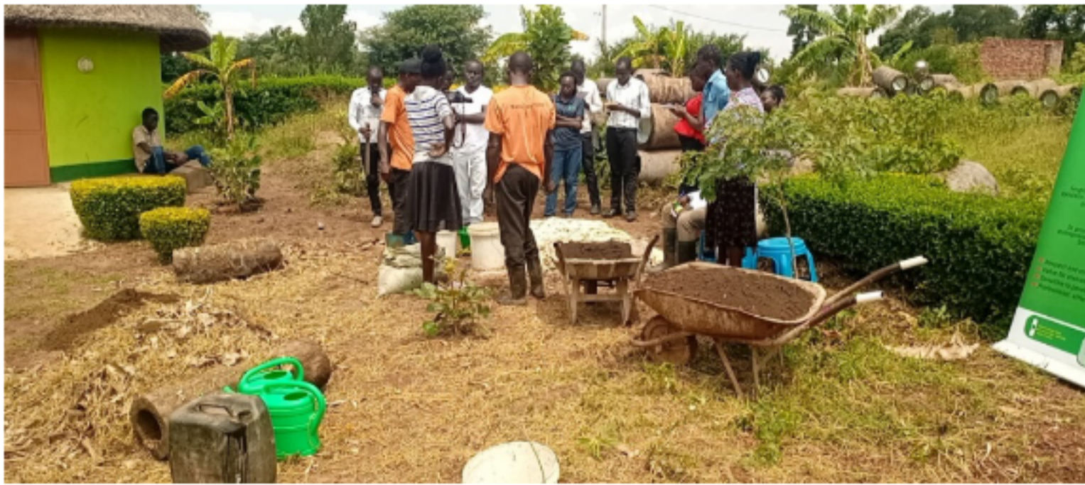
Training Agrisol Africa Limited Staffs on BOKASHI making an organic fertilizer