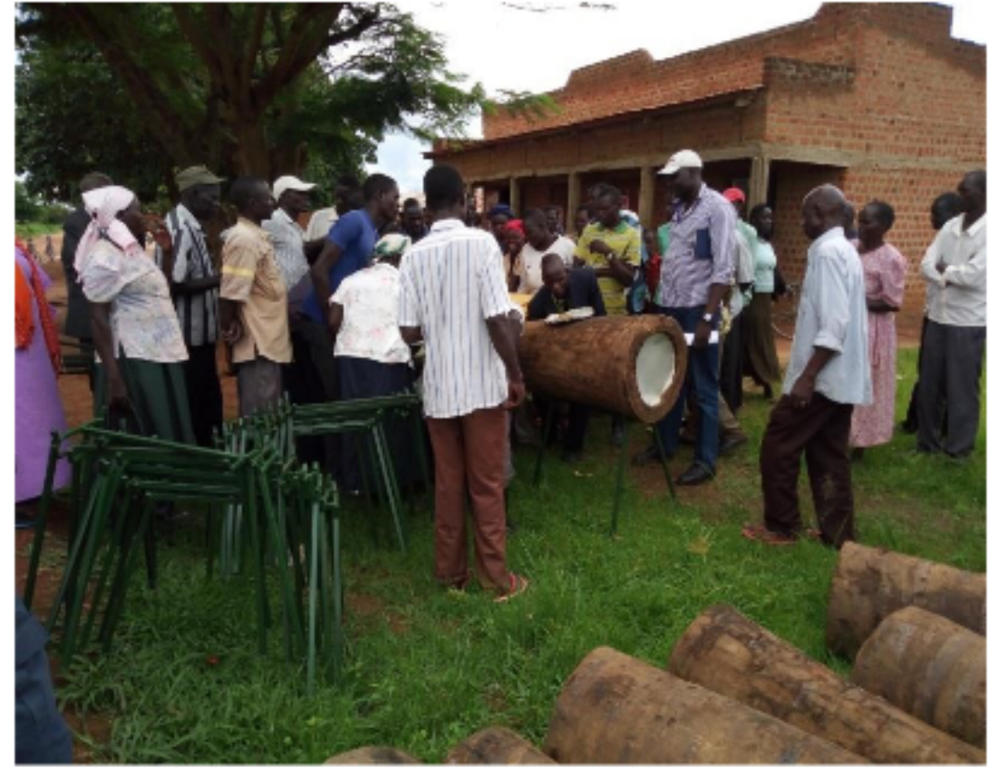
TRAINING AND DISTRIBUTION OF BEE HIVE TO FARMERS IN DOKOLO DISTRICT UNDER NUSAF III PROGRAM