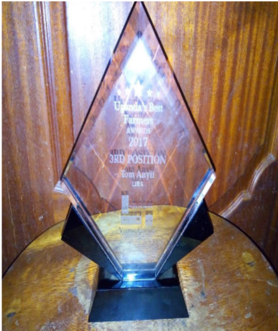
BEST FARMER TROPY AWARD