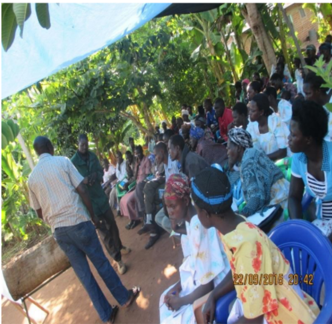
Farmers getting training on proper bee keeping management in a traditional improved hive at the farm