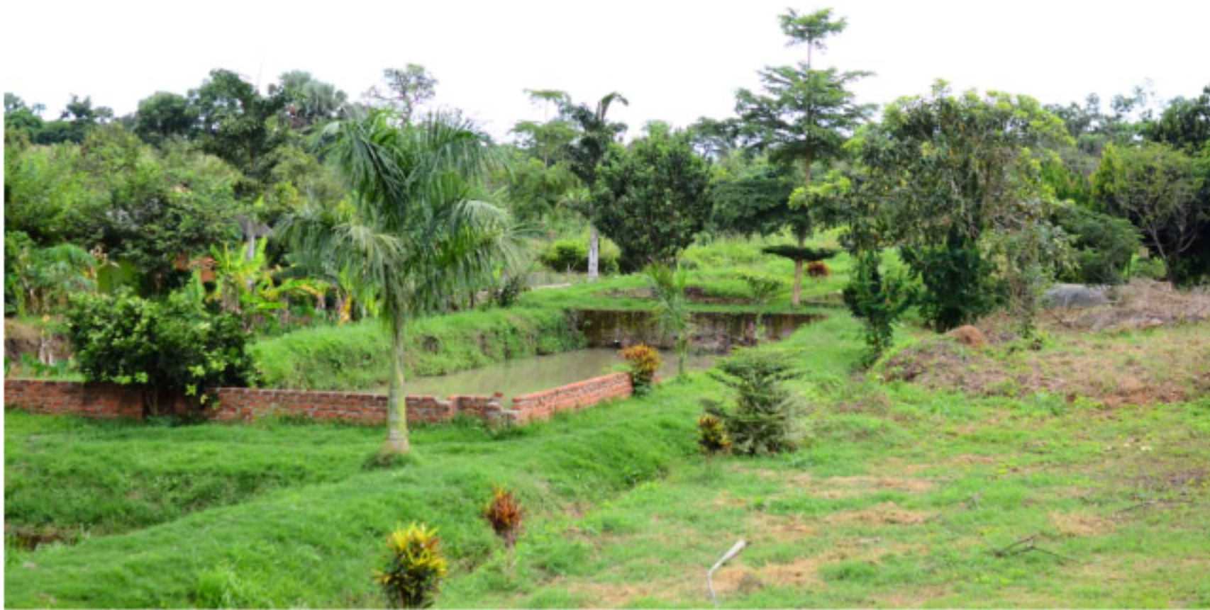
A view of Taf fish ponds