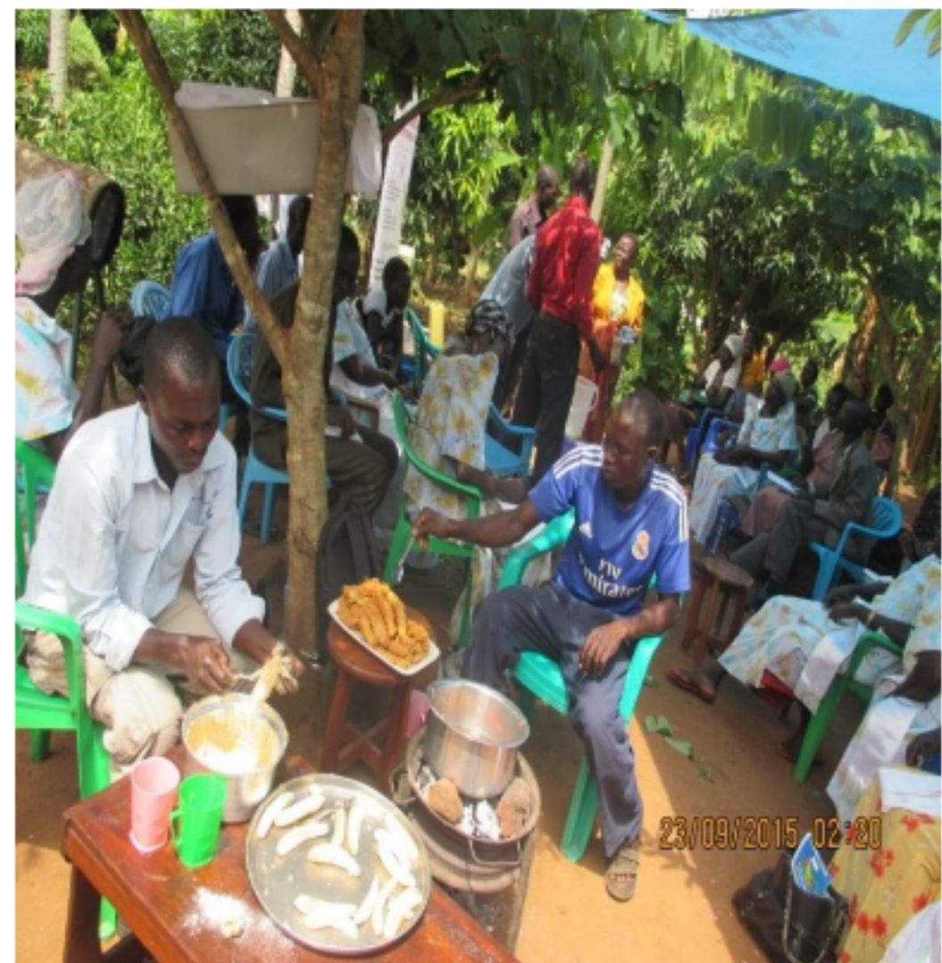
Farmers getting training on value addition at the farm practically