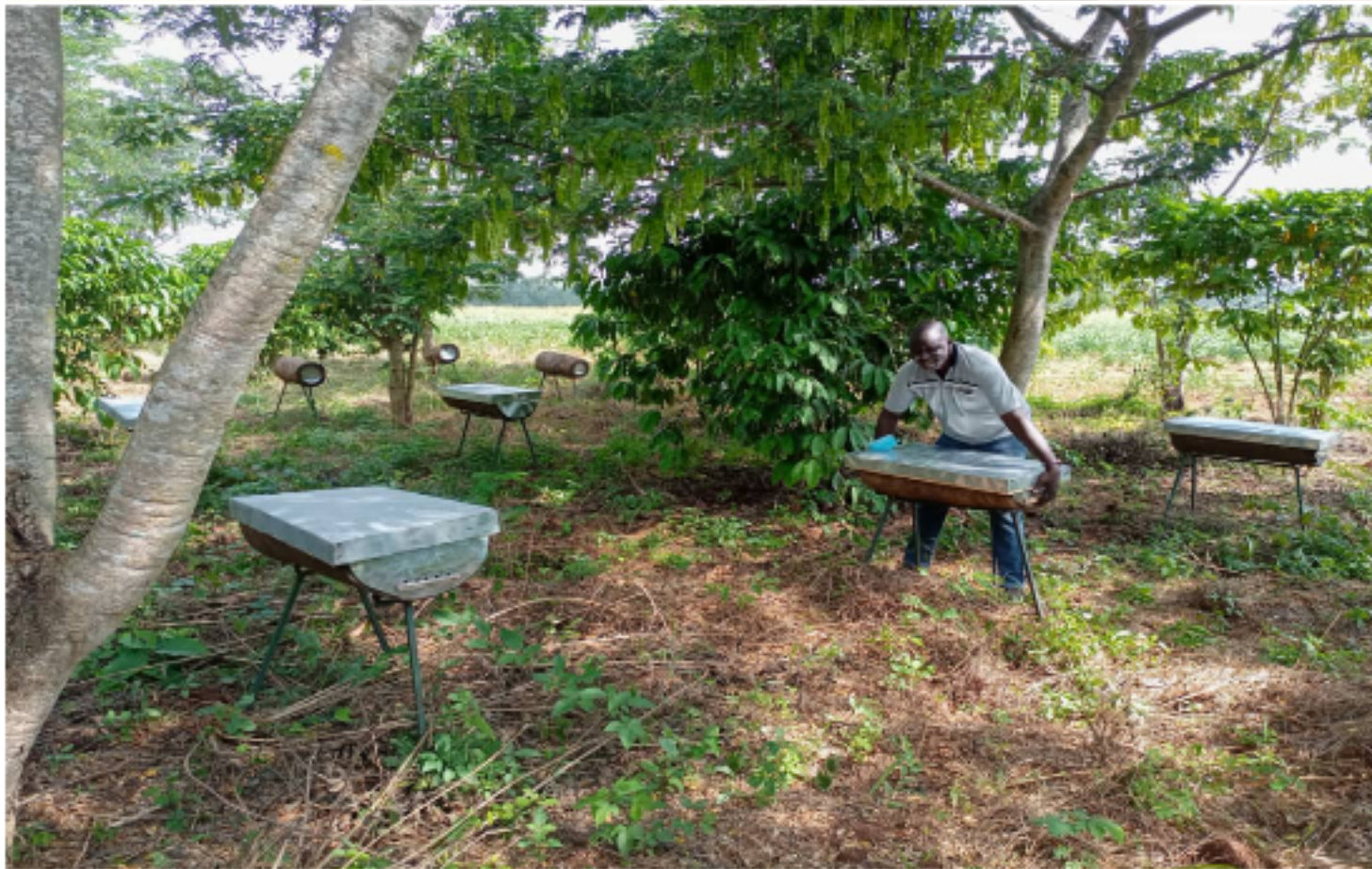
Bee Hive installation in the Apiary