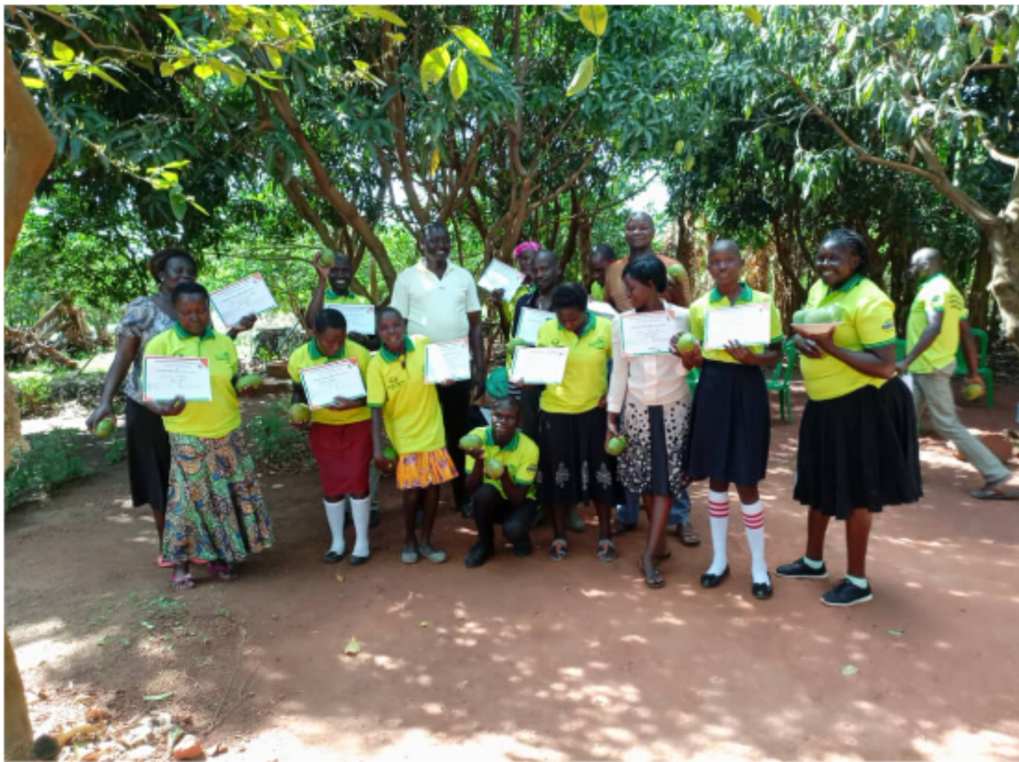
Telela Cell, Telela Ward Ngetta Lira City East Division Lira City, Uganda