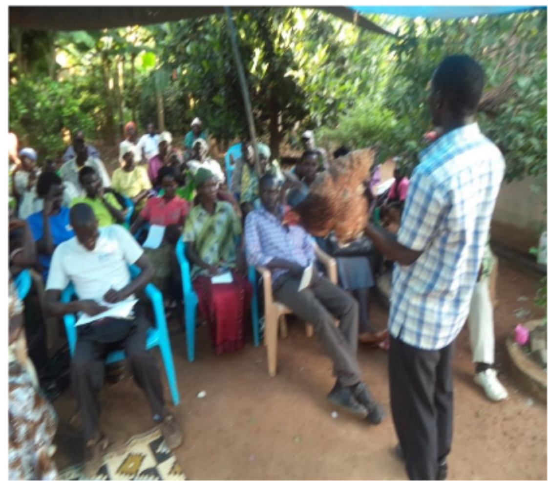
Farmers getting training of proper local chicken rearing and breed selection techniques at the farm premises by veterinary officer.