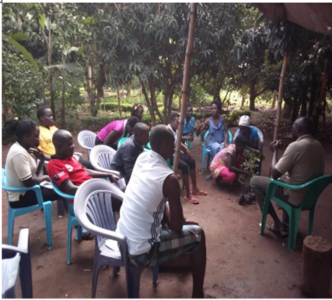
TRAINING STUDENTS FROM NYABEYA FORESTRY COLLEGE MASINDI AT THE FARM