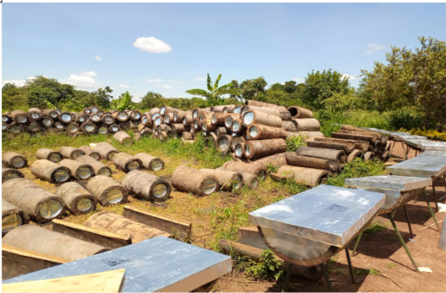
TAF Improved Bee Hives ready for sale at TAF Premises.