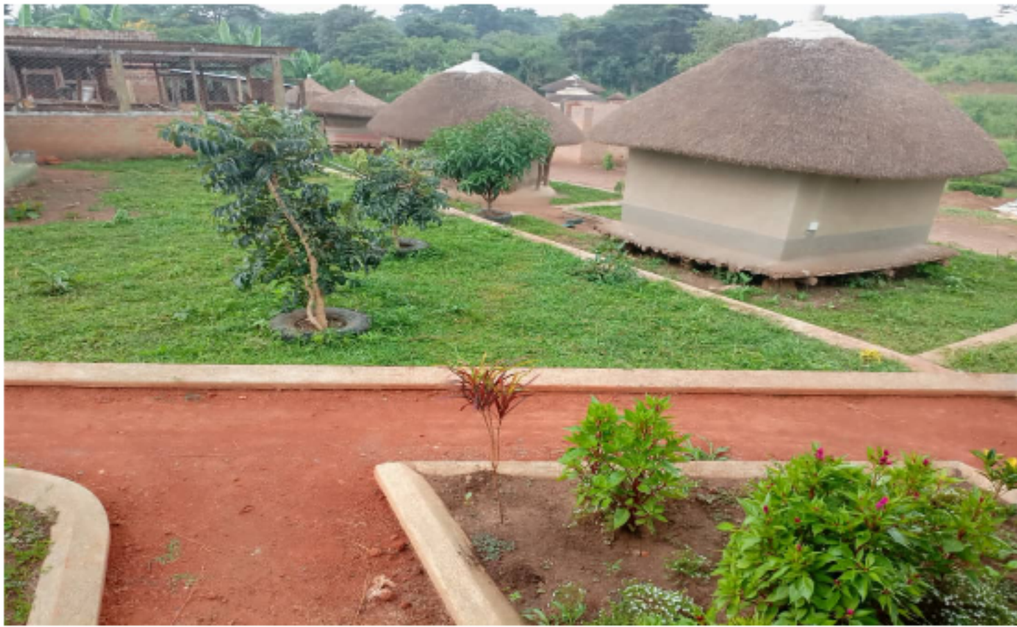
Telela Cell, Telela Ward Ngetta Lira City East Division Lira City, Uganda