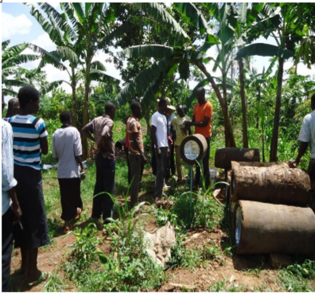
Youth groups getting skills on bee keeping at the farm premises