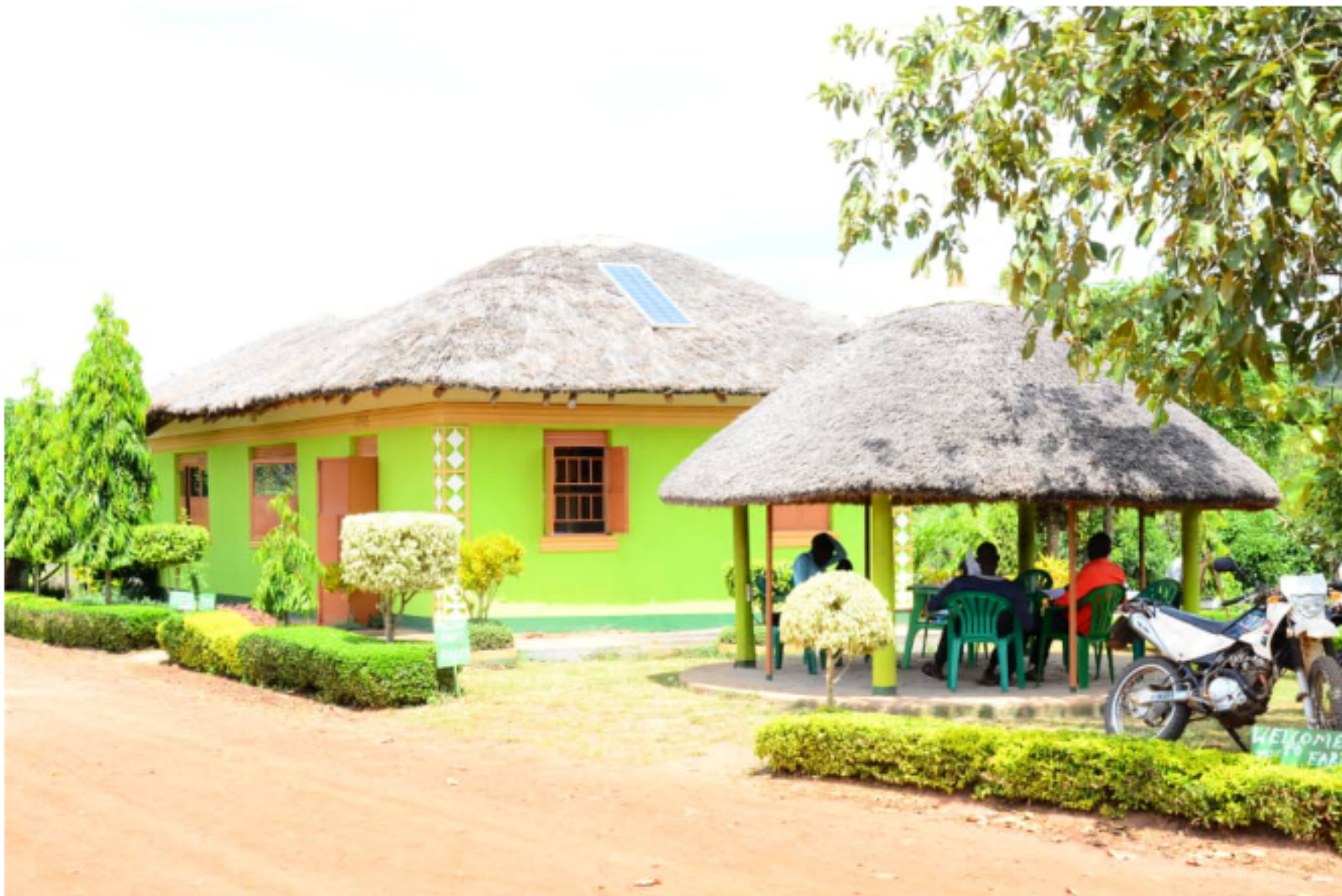
Taf Administrative Block